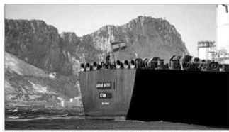
The Grace 1, renamed the Adrian Darya 1, leaves anchorage off Gibraltar on Sunday.

An Iranian tanker at the centre of an angry confrontation between Iran and Washington sailed for Greece on Monday after it was freed from detention off Gibraltar, as Tehran said any US move to seize the vessel again would have "heavy consequences".