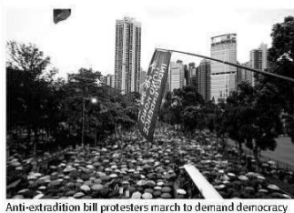
Anti-extradition bill protesters march to demand democracy and political reforms, in Hong Kong, on Sunday.

Hong Kong is gearing up for further protests this week after hundreds of thousands of anti-government demonstrators braved heavy rain to rally peacefully on Sunday, marking a change to what have often been violent dashes.